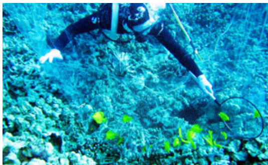
Aquarium collector taking fish off of Hawai'i reef.